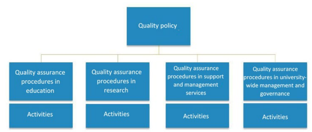
Figure 2: Structure of the quality assurance system at the University of Skövde